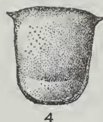
Text-fig. 3.— Stenixus rhachynotus new species. Male. Type . Mt. Lamington, Northern Division, Papua. Dorsal view of ultimate tergite and forceps (greatly enlarged).